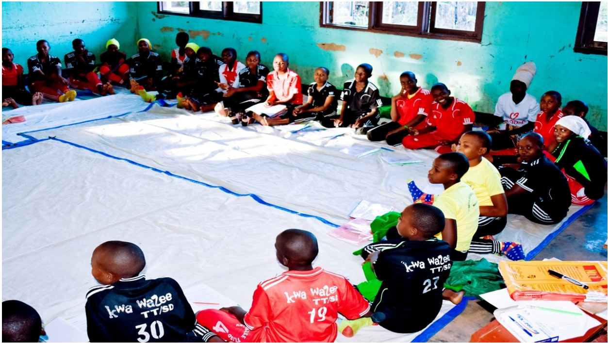
Self-defense training for girls

training; 7 girls reported on being raped, 13 girls reported on tempted to rape, 60 reported to be touched their bodies, 9 girls reported to be harassed by their relatives and 50 to get harsh words from boys. After completing the course we choose the assistant trainer who performed better during the course to assist the group and we will meet with them for monthly training to improve their skills in self-defense training.