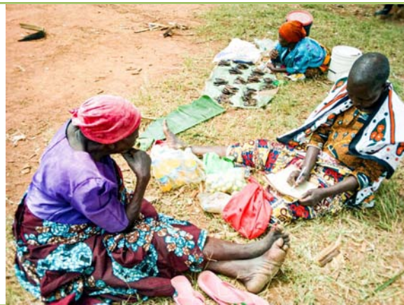
Mutual support group's meeting (in first photo) and older people selling various products as income generating activity(In second photo)

The challenges; the groups have been supported with goats as the revolving funds which helps to increase their income, they require more loans based on cash to start a business like storing food crops, purchase manure and do business. To solve this we would like to connect them with Districts where they could access 6% of the District income to support vulnerable groups such as women, disabled people and youth but also the revolving funds would save the groups at individual level to start small income projects.