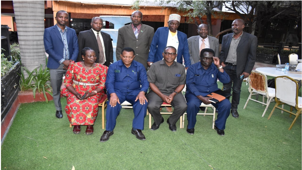
What we call a “Bridge” a photo taken afetr engaigement meeting which involve the National Ageing forumn, MP from Muleba district and Kwa Wazee org held in Dodoma Region