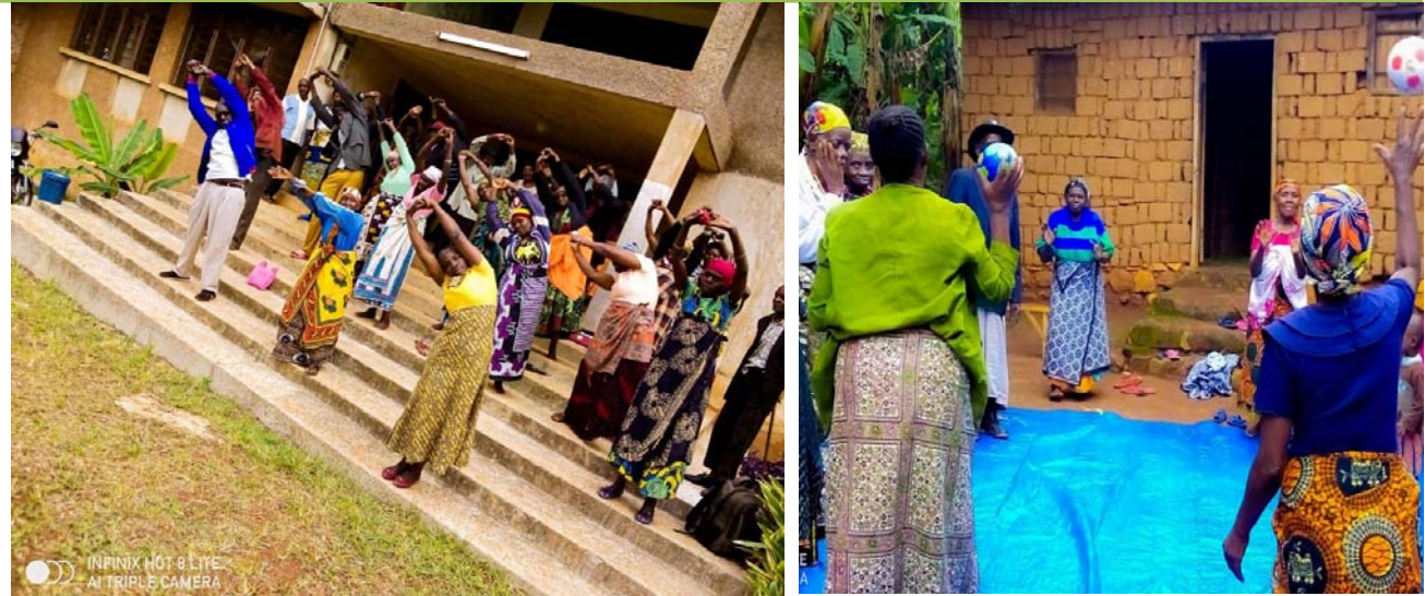
Older people exercise in Nsisha and Mugaba

We have financially supported 5 older people with serious cases to access health services in various hospitals. One older people were supported with spectacles. We have also conducted group monitoring in Mubunda, Biirabo and Mugaba and 196 older people attended groups meetings during the visit.