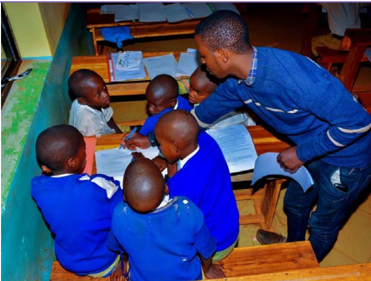
Photo taken during PiaD Training in Kanoni Primary school

One day when I was back home, I met with my neighbor who had grabbed a stick. He canded me with stick. I cried a lot and asked why he has beaten me, he told me that every day I scolded his children that they always eat alocasia (magimbi). When he left me, I ran home and met their chicken. I killed his chicken and throw it to it his shamba. His children saw me and sued me to their dad. They reported me to my parents and I was whipped ten sticks. I was so angry to the extent that I even felt to kill someone. But i am very grateful to the Peace ia a Decision facilitators to educate us and now I can't do any violence action. I promise to be a good person in the community